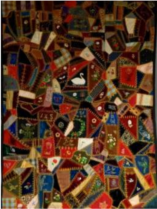
New York, 1890 145 x 202 cm