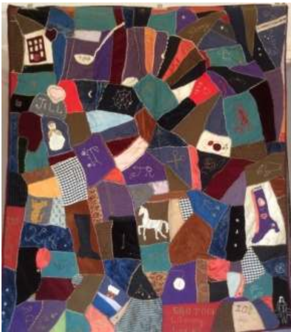
Easton, Pennsylvania, 1898 100 x 116 cm