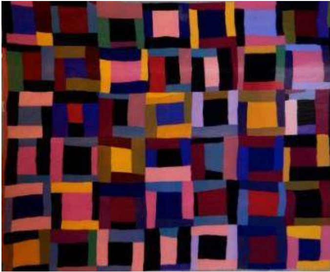
Virginia, 1940 180 x 214 cm