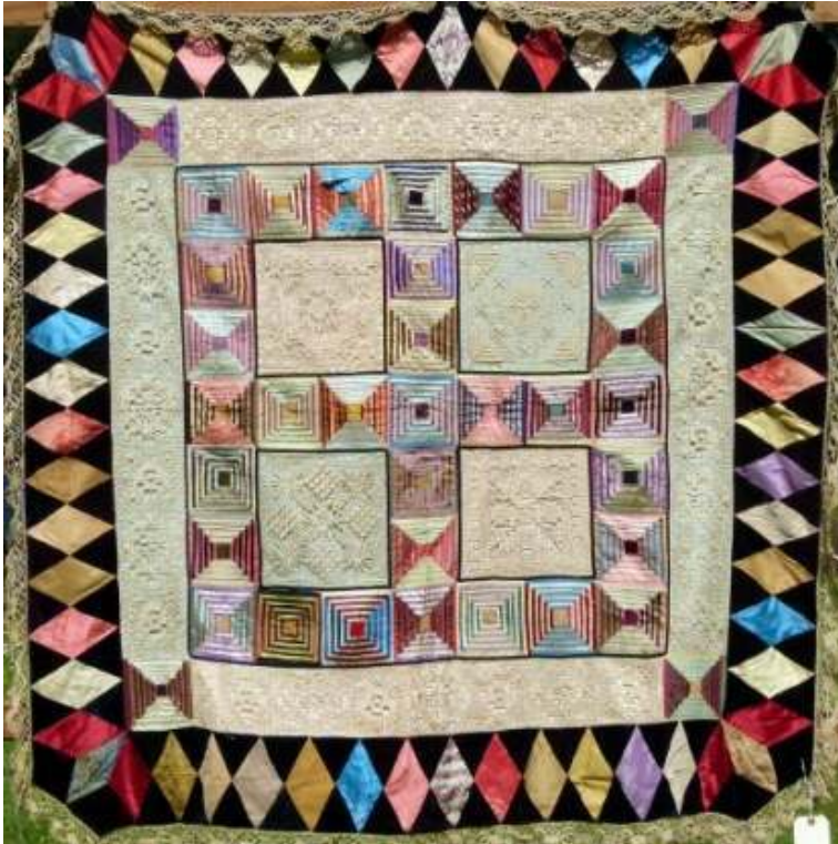
New York State, c.1890 162 x 164 cm