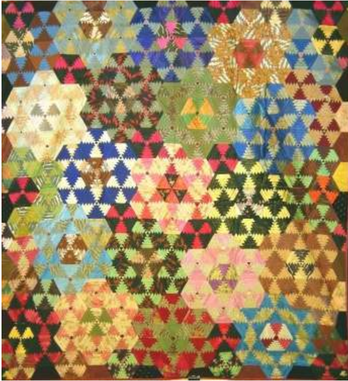
Connecticut, 1870 153 x 163 cm