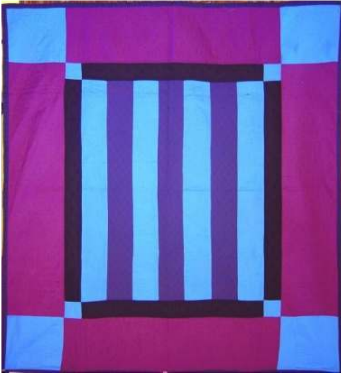
Pennsylvania, Lancaster County, c.1930 180 x 192 cm