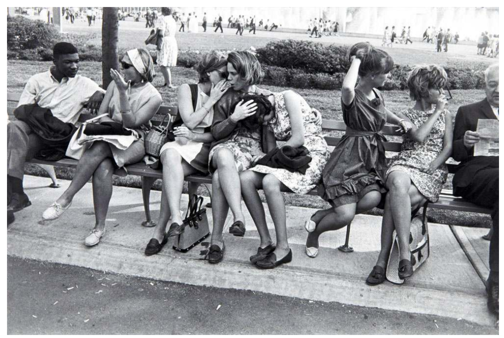
World's Fair, New York, 1964.