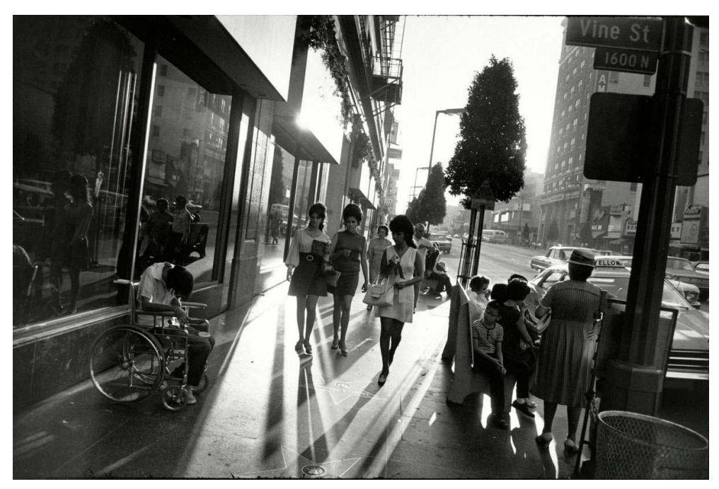
Los Angeles, 1969.