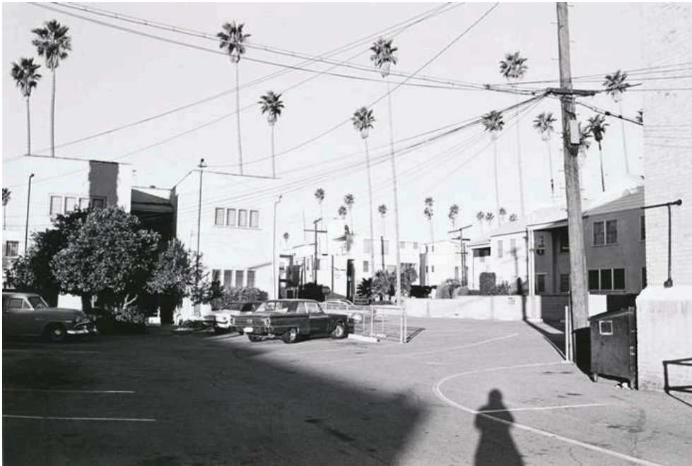
Henry Wessel, Hollywood, California, 1972.