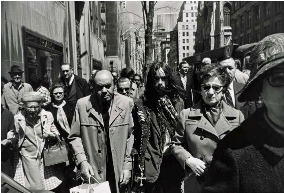
Garry Winogrand, New York, 1970 (149).