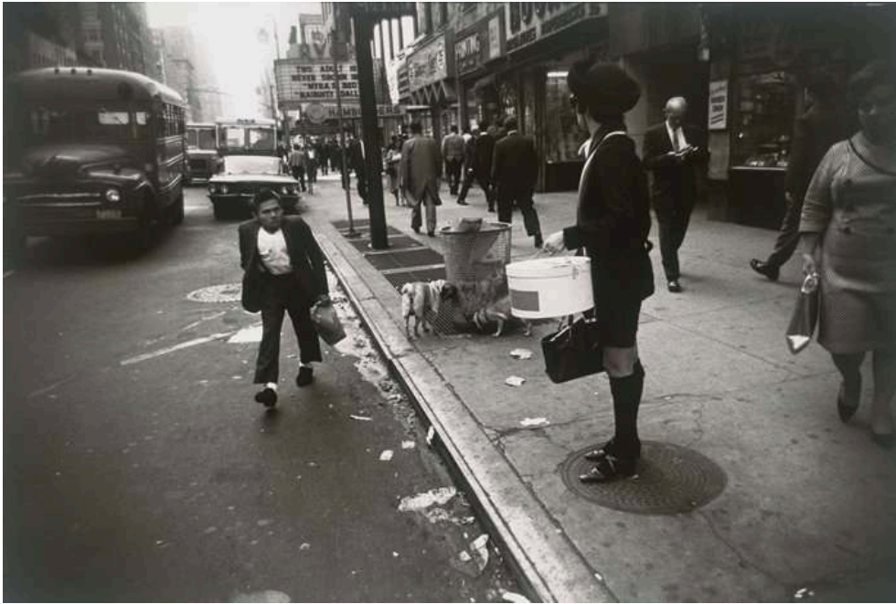
Garry Winogrand, New York, 1968 (114).