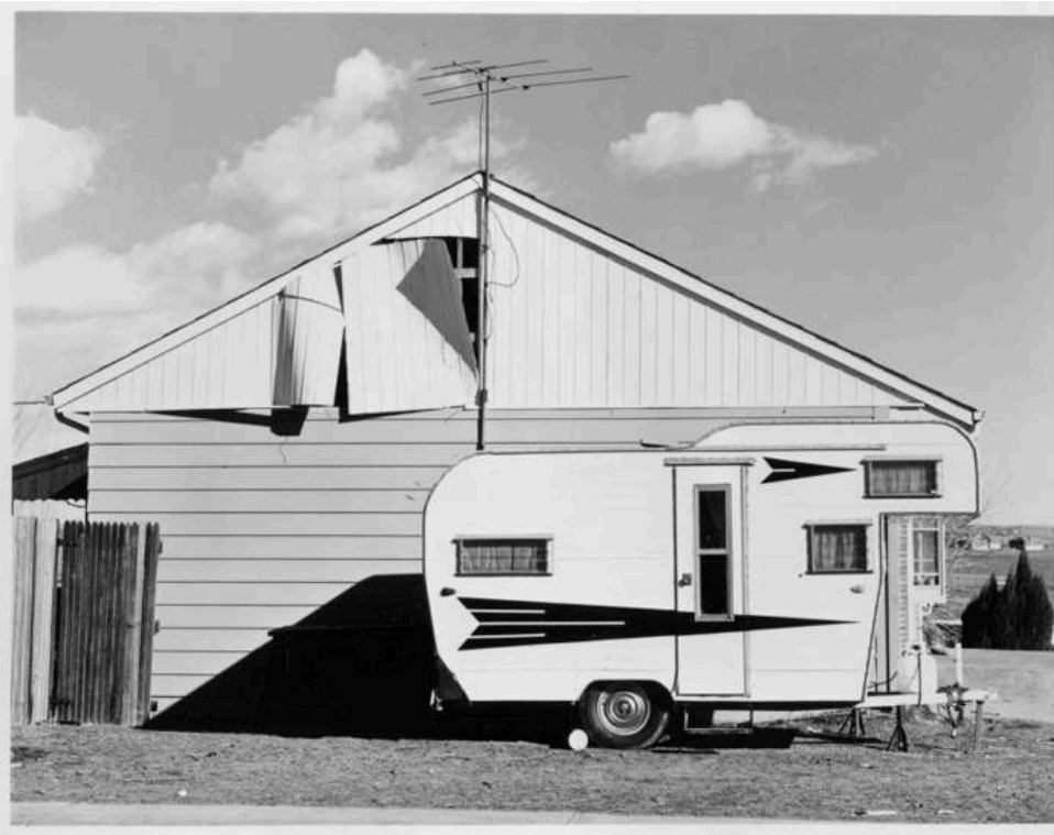
Robert Adams, Tract House, Westminster, Colorado, 1974.