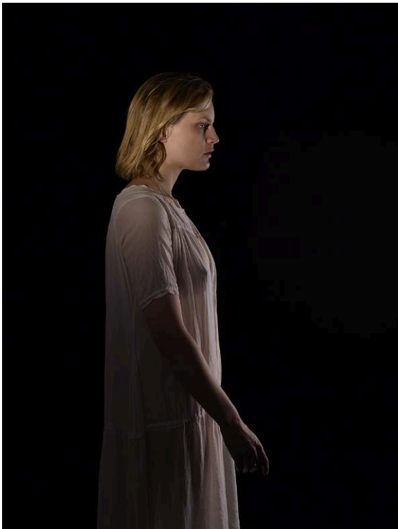
Catherine Opie, Guinevere , 2012, Pigment print, 33 x 25 inches

© Catherine Opie, Courtesy of Regen Projects, Los Angeles