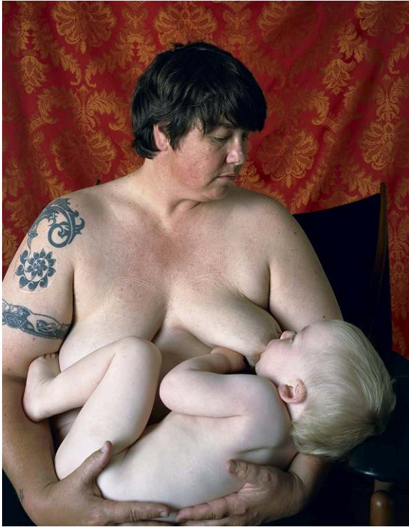
Catherine Opie, Self-portrait / Nursing , 1994, C-print, 40 x 30 inches

© Catherine Opie, Courtesy of Regen Projects, Los Angeles