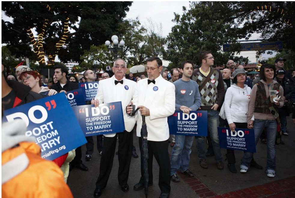
Catherine Opie, Untitled # 1 (March 4th, 2009) , 2009, Inkjet print, 37 1/2 x 50 inches

© Catherine Opie, Courtesy of Regen Projects, Los Angeles