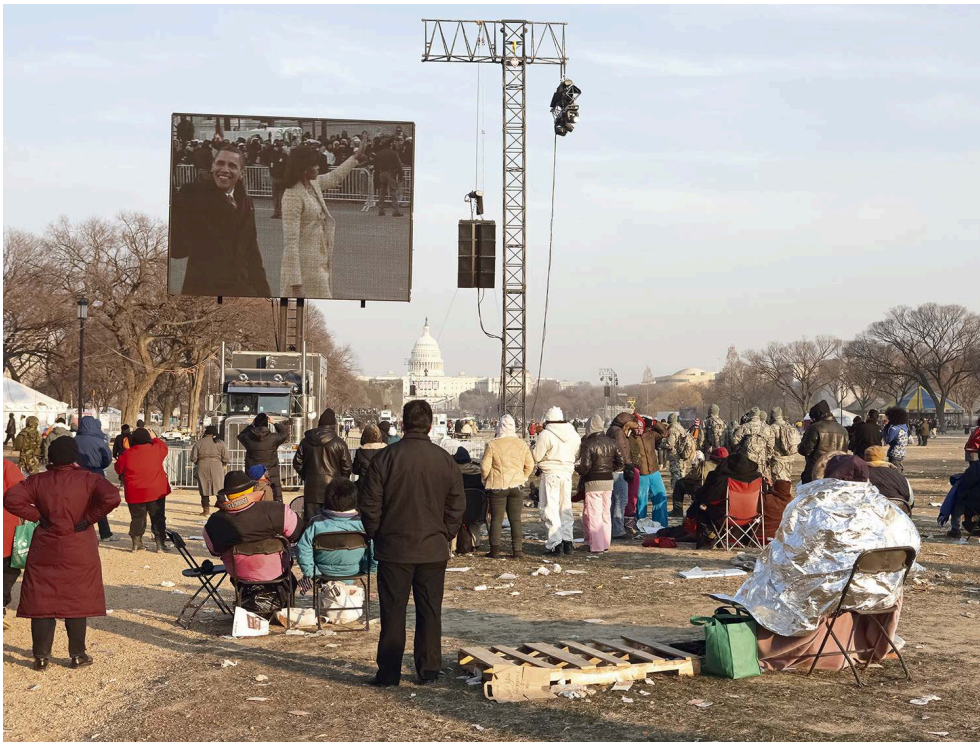
Catherine Opie, Untitled #1 (Jan. 20th, 2009) , 2009, C-print, 37.5 x 50 inches

© Catherine Opie, Courtesy of Regen Projects, Los Angeles