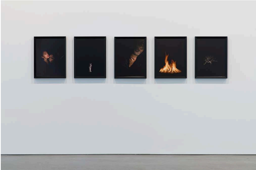
Brian Forrest, Installation View of Catherine Opie at Regen Projects, Los Angeles , February 23 - March 29, 2013