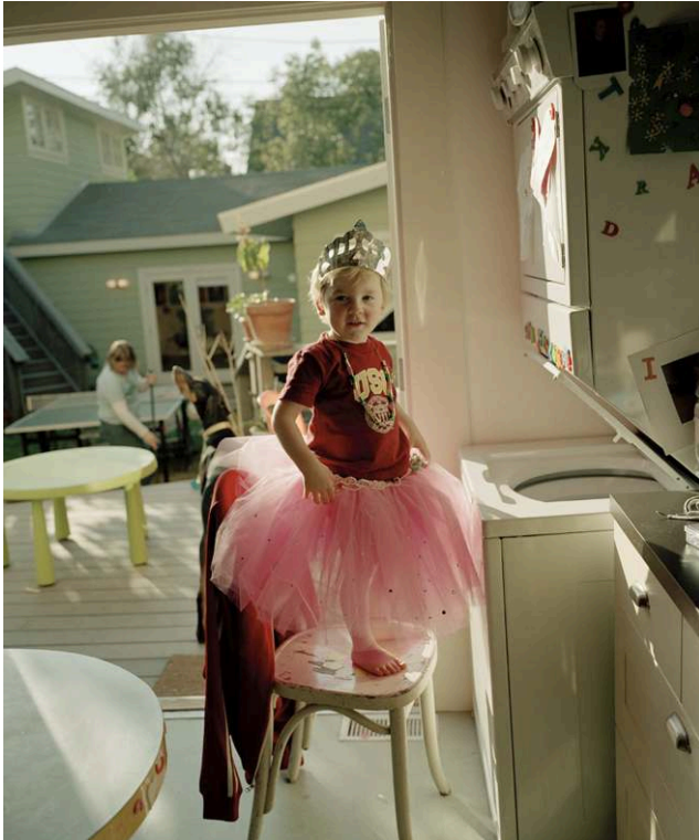
Catherine Opie, Oliver in a Tutu, In and Around Home , 2004, C-print, 24 x 20 inches