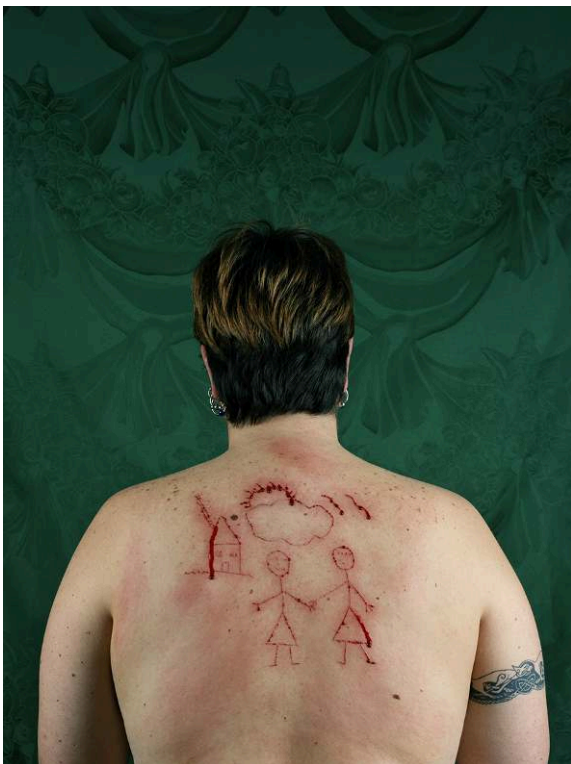
Catherine Opie, Self-portrait / Cutting , 1993, C-print, 40 x 30 inches

JM: You know that I'm very much into self-portraits, they are the subject of my research, and I think you expect a lot of questions about them from me. Are you proud or a little bit weary that people keep asking you about your self-portraits fifteen years after they've been done?