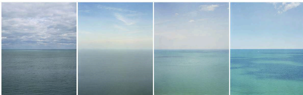
Catherine Opie, Lake Michigan, Fall, Winter, Spring and Summer , 2004-2005, four C-prints, 50 x 40 inches

CO: It's heavily curated, it's not the self-portraits. [laughs] It's the four seasons of Lake Michigan in Chicago.