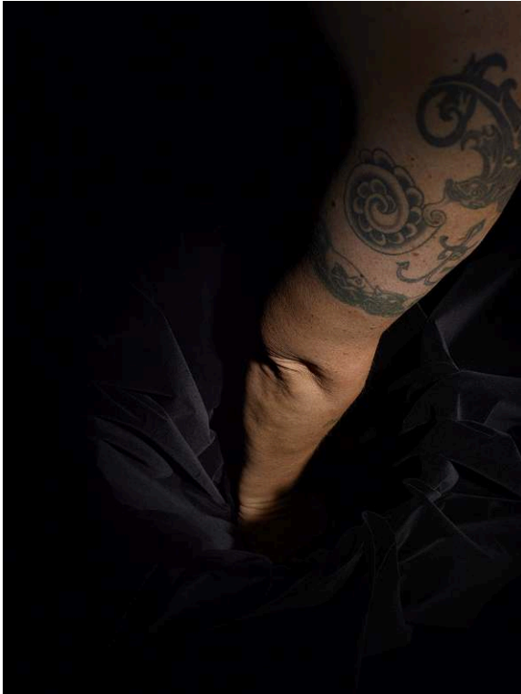
Catherine Opie, Arm , 2012, Pigment print, 24 x 18 inches

© Catherine Opie, Courtesy of Regen Projects, Los Angeles