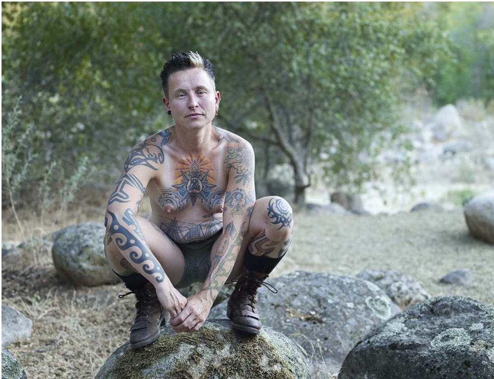
Catherine Opie, Idexa , 2008, C-print, 37 1/2 x 50 inches