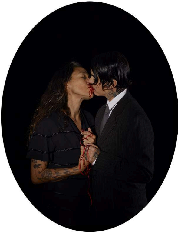
Catherine Opie, Julie & Pigpen , 2012, Pigment print, 50 x 30 inches