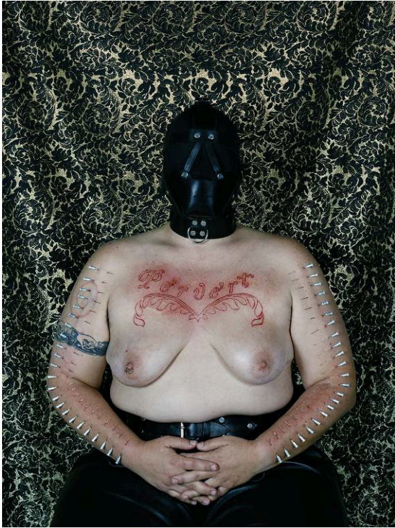
Catherine Opie, Self-portrait / Pervert , 1994, C-print, 40 x 30 inches