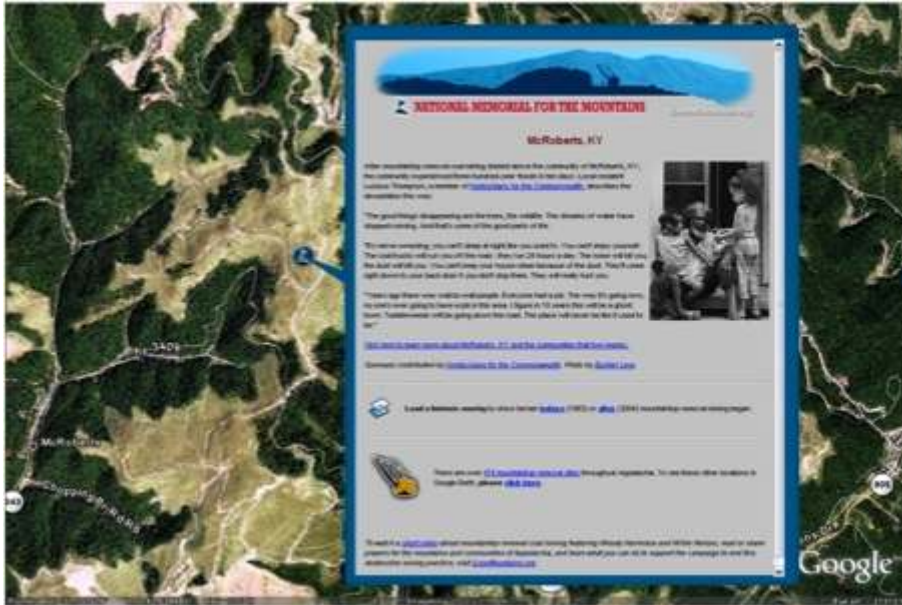
Figure 6. Appalachian Mountaintop Removal (GE, retrieved on Jan. 12, 2012).