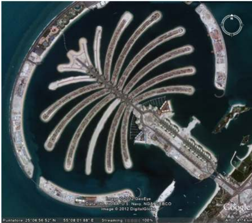
Figure 9. Palm Jumeirah, Dubai (GE, retrieved on Jan. 2012).