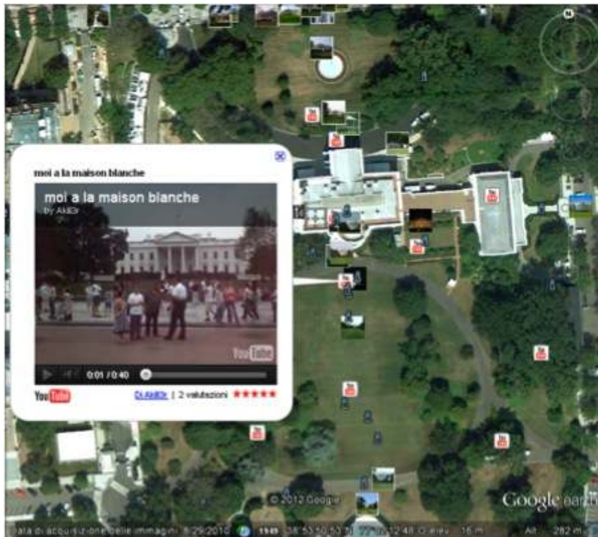
Figure 4. Mapping oneself on the White House (GE, retrieved on Jan. 21, 2012).