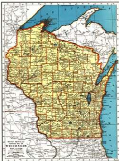
Figure 2. Rand McNally map of Wisconsin, 1944.