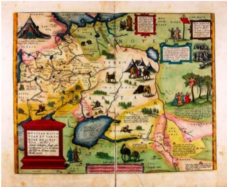
Figure 1. Chorographic map of Moscow and Tartary from Abraham Ortelius' Theatrum Orbis Terrarum , 1574 (Courtesy of the University of Bristol Library Special Collections).