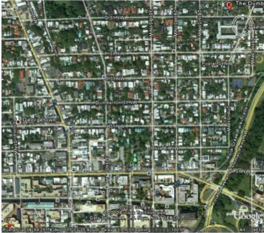
Figure 8. Georgetown, Washington DC (GE, retrieved on Jan. 2012).

practicality of the rectilinear grid—a metaphor for modernity—the new GE-inspired planning projects are utterly impractical. Take a plan of Washington DC or any other American city—rectilinear, rational, easy to navigate [Fig. 8].