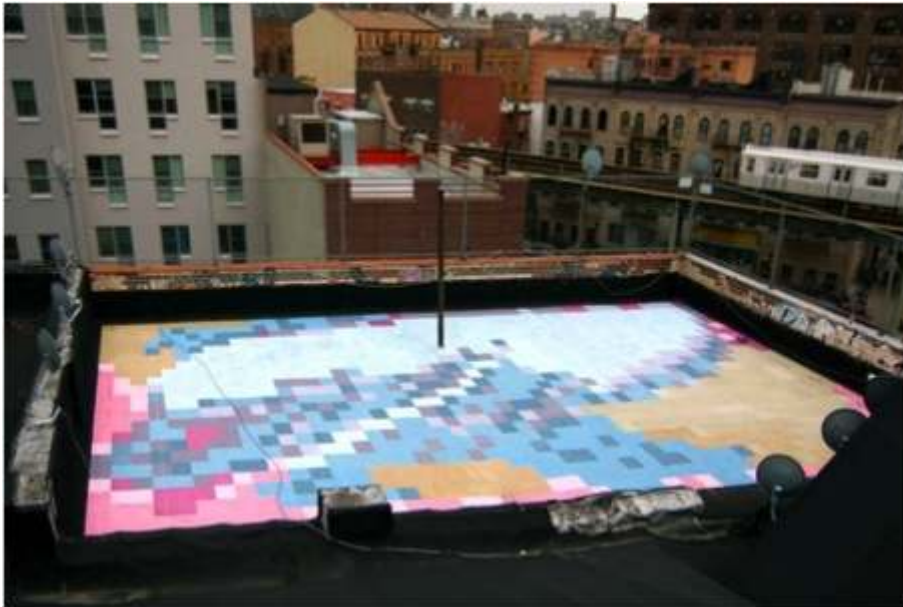
Figure 7. Molly Dilworth's painting for satellite (source: http://inhabitat.com/stunning-rooftop-paintings-that-can-be-seen-from-satellites/ ).