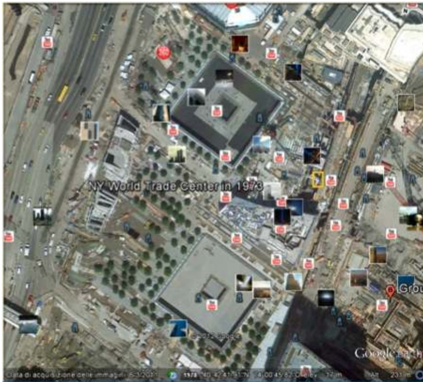
Figure 5. The site of Ground Zero (GE, retrieved on Jan. 12, 2012).