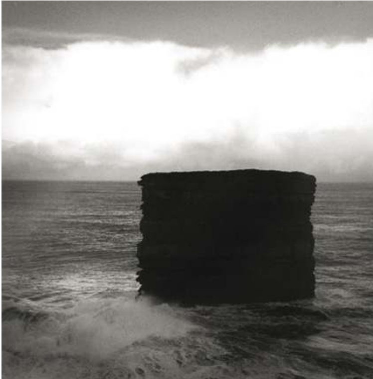
Winter Solstice. Dún Briste, a sea stack.