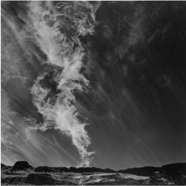
Clouds. Flying Cloud.