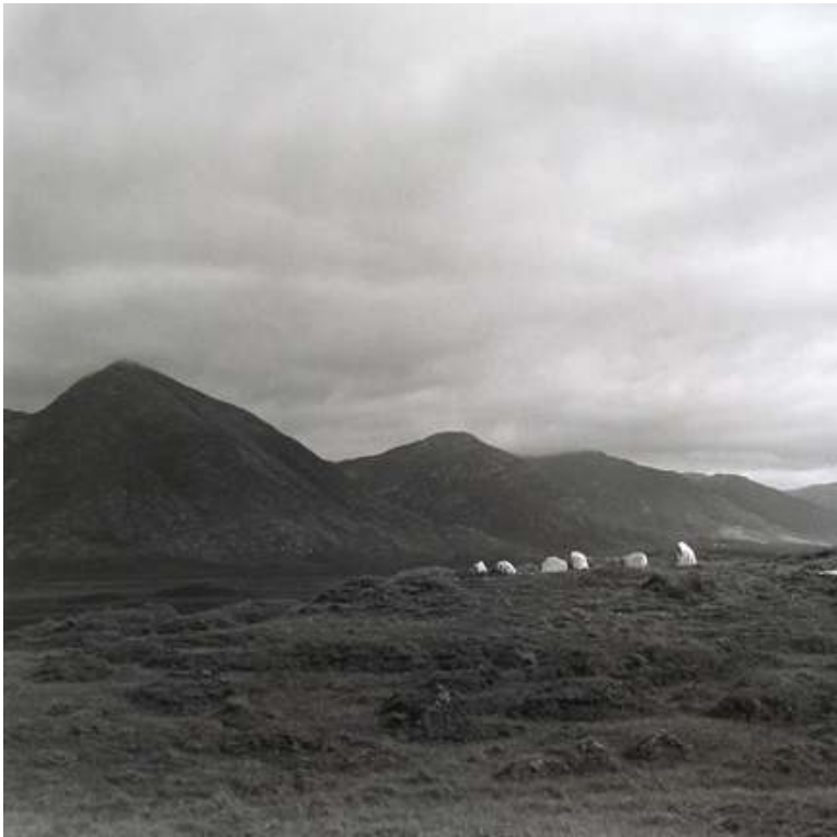
Field Work. White Stone Alignment, Connemara.

Landscape works better for me. I pass a place, I want to come back to it. I read about its history, and then it's a slow contemplative process. I am often looking for traces of human activity in a landscape, a kind of historic interaction, how one affects the other. My series Field Work is the most obvious expression of that concept.