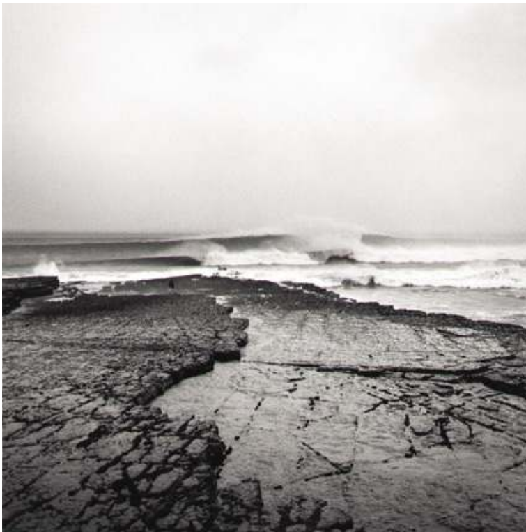
Winter Solstice. Man standing before the waves.

Mary Oliver. We were very old friends going back to the mid-1970s in Provincetown, a beautiful place rich with artists and writers. I am a great admirer of her work, especially the earlier work. When I was putting together the Solstice book I asked her to write the foreword as her writings about nature are so—well, poetic. I was hoping she would write about the importance and meaning of the solstices but she chose to write about Ireland instead, a place she has never visited. You can't tell a writer of her stature what to say, and I was grateful that she did it.