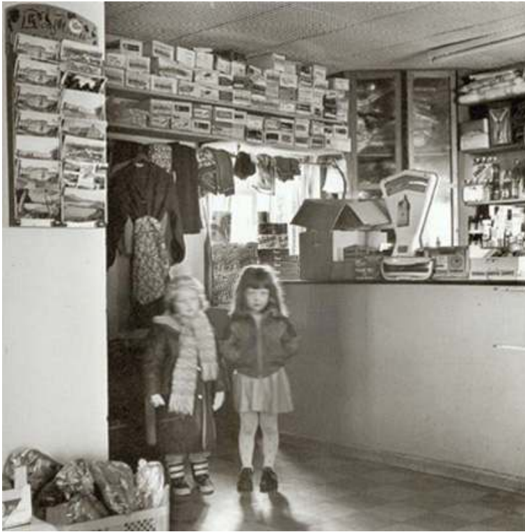
A Shop in Gortahork