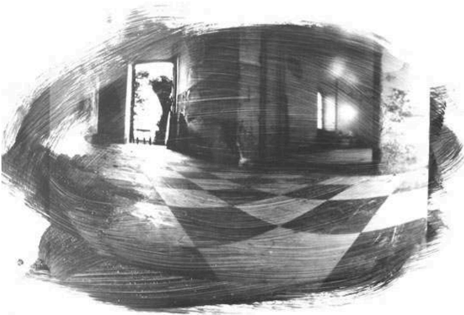
Door into back garden, window, ©2005 Rachel Brown