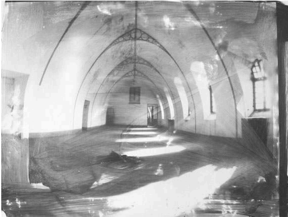
Arched dortoir II, small sun patches