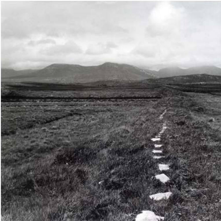
Field Work. Stepping Stones in a Bog, Connemara.

Is there an American style? I think American photographers have a looser attitude, capable, even, of productive, meaningful messiness. The idea of perfection is not so important. Most of my own photographs are at the studied, orderly end of the scale, but not so classically "perfect". Americans seem to go for the sociology; Eugene Richards, Eugene Smith and Nan Goldin for instance, exemplify photography of trouble, violence and suffering. The WPA photographers of the '30s and '40s captured a vast and beautiful archive of sociological photography. Now, the vibrant new movement toward the spontaneous is producing wonderfully fresh images. I think digital photography is making this possible. I don't enjoy doing digital photography so I don't do any serious work in this medium.