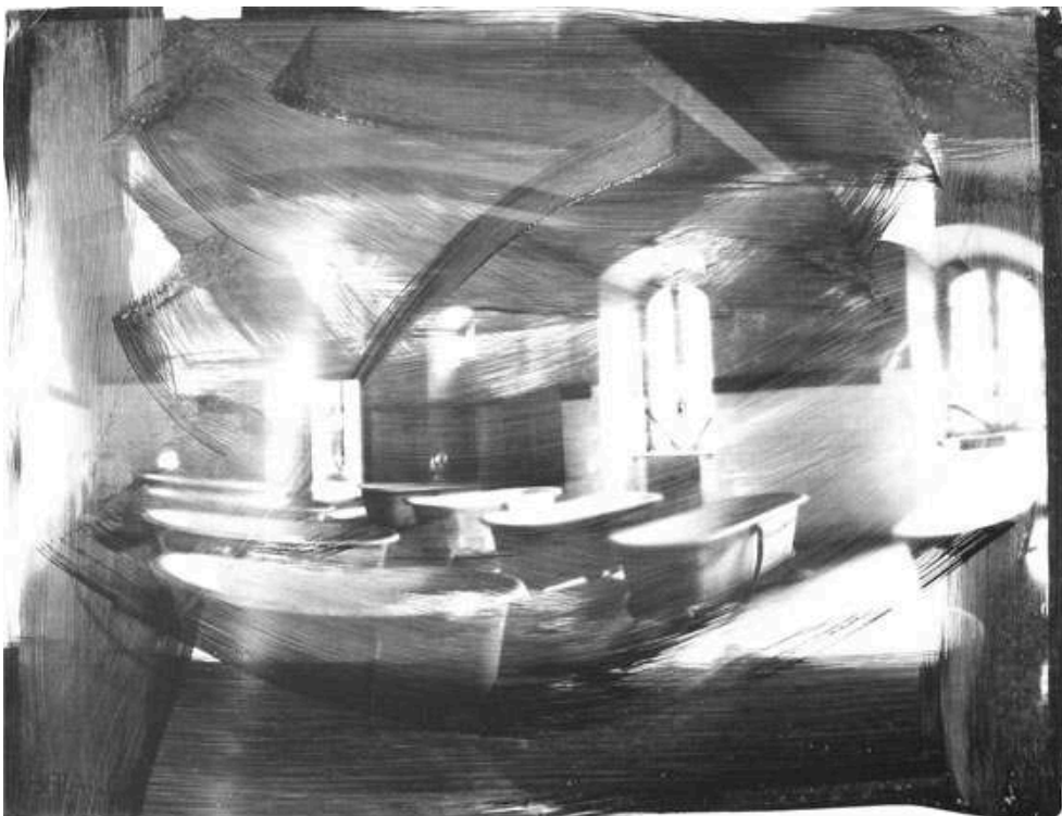
Baignoire