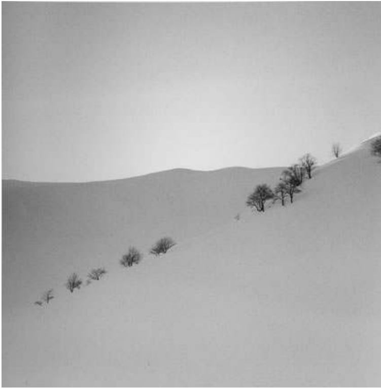
Snow. Hillside at Daybreak.