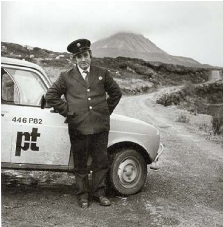
The Postman, ©1987 Rachel Brown

When you are traveling, the newness helps. When you are a foreigner, you see things that are commonplace to the locals in a fresh way.